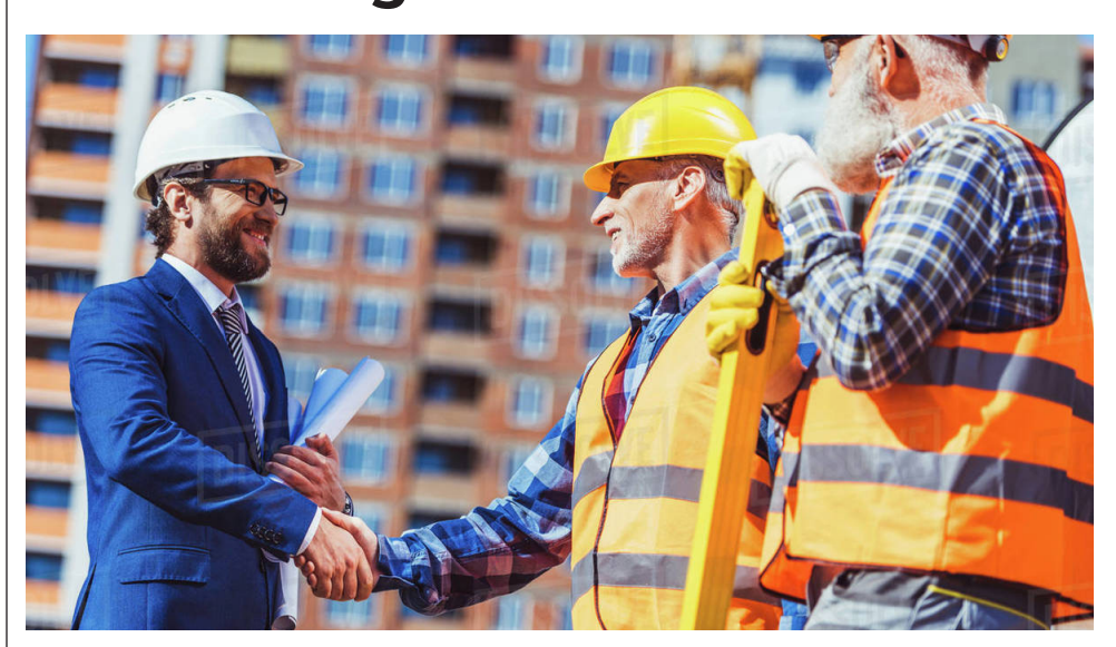
[ Article was originally posted on www.clevelandconstruction.com ]